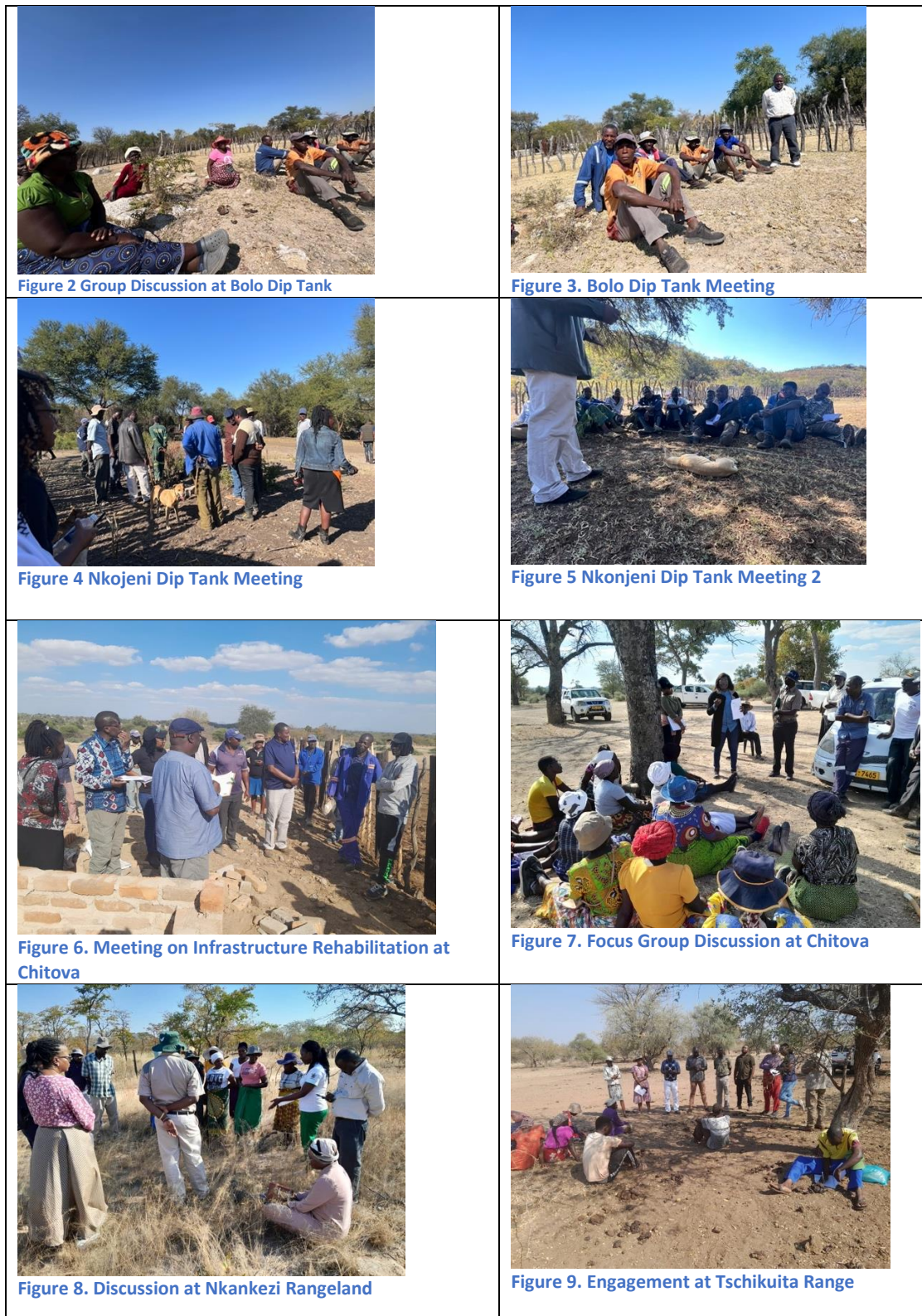
Table 1. Pictures Of The Community Engagements During The Appraisal Mission